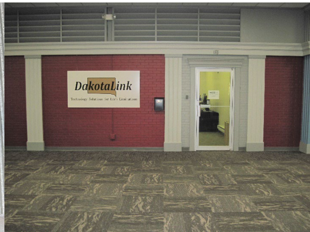
Aberdeen – 1 605-380-9790