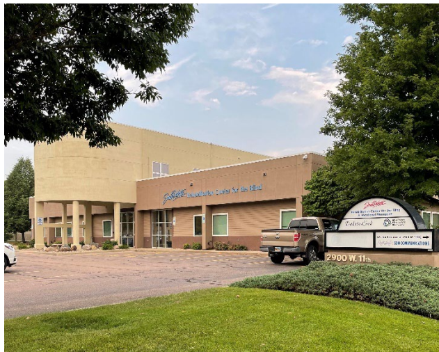
Sioux Falls – 1-605-334-9099