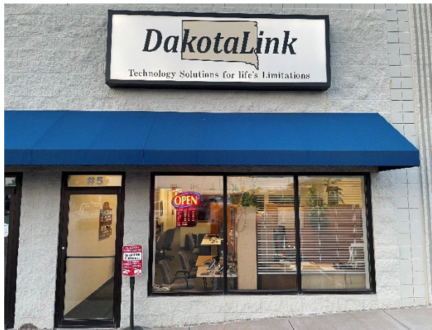
Rapid City – 1-605-394-6742

Below are pictures of our offices throughout the state.