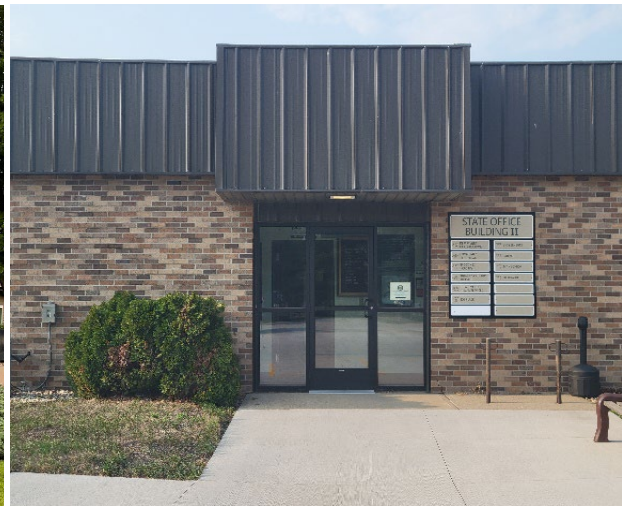
Brookings – 1-605-690-5348